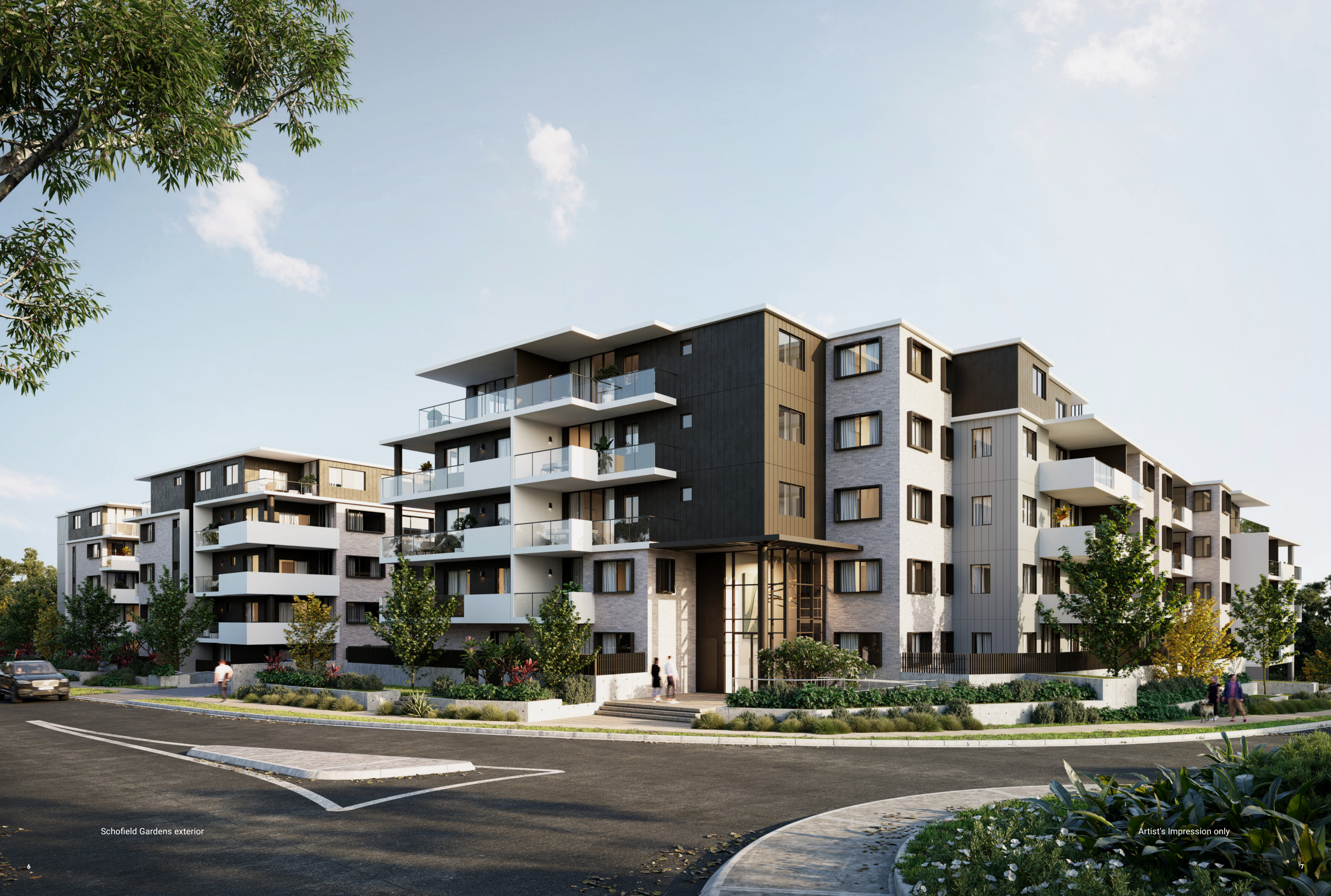
Schofield Gardens exterior