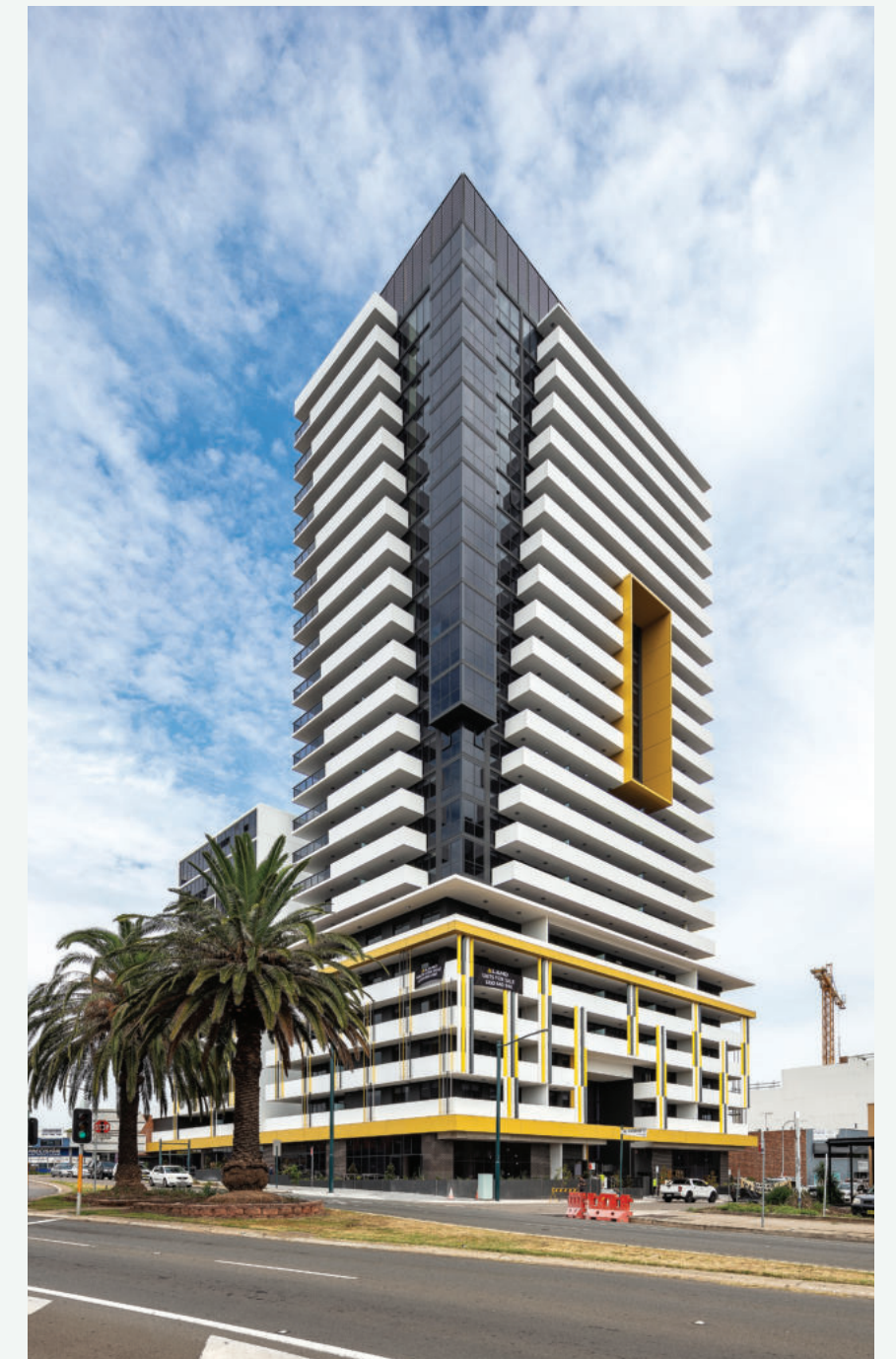
387 Macquarie Street, Liverpool