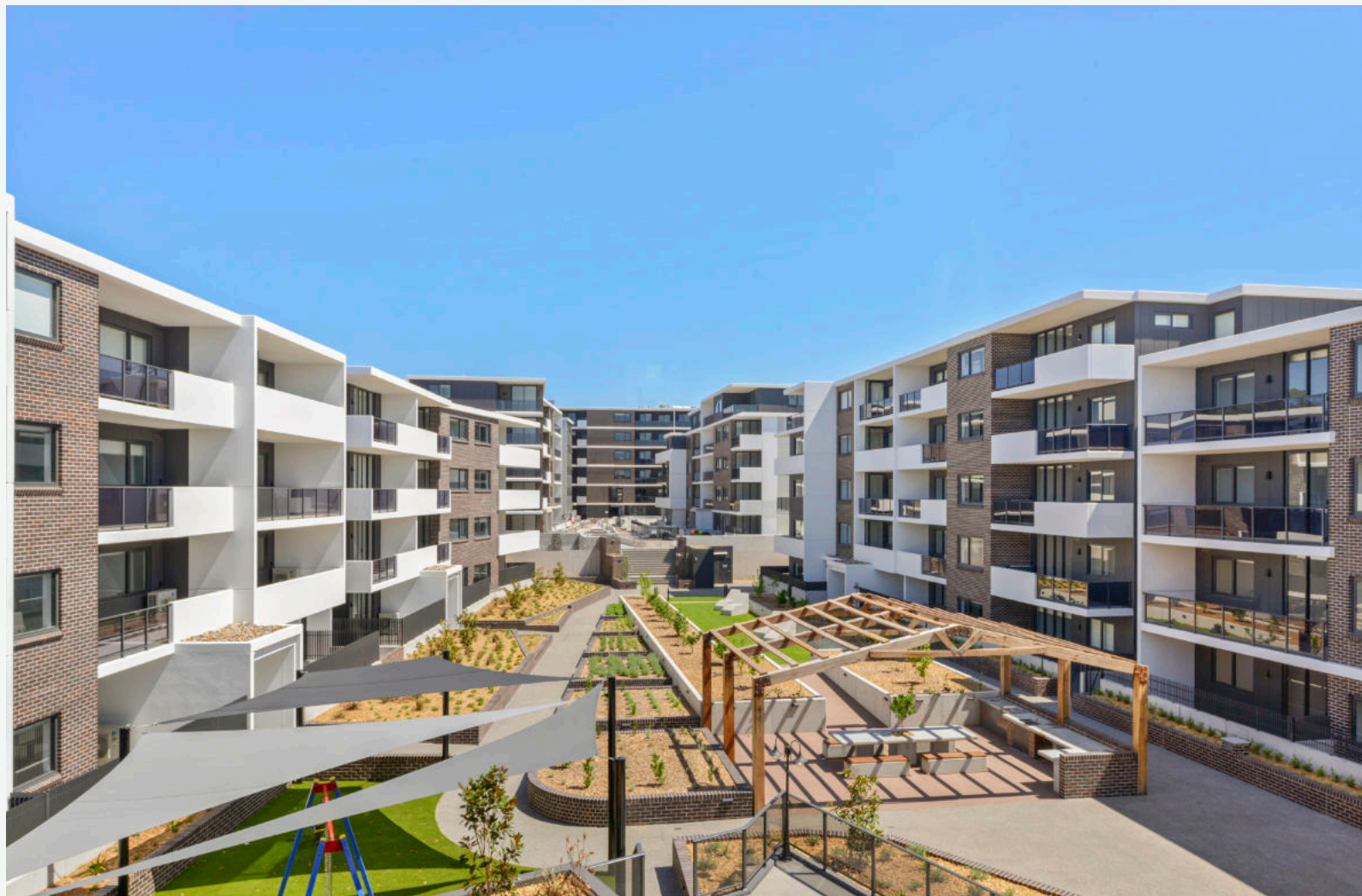
Bottlebrush, Schofield Gardens