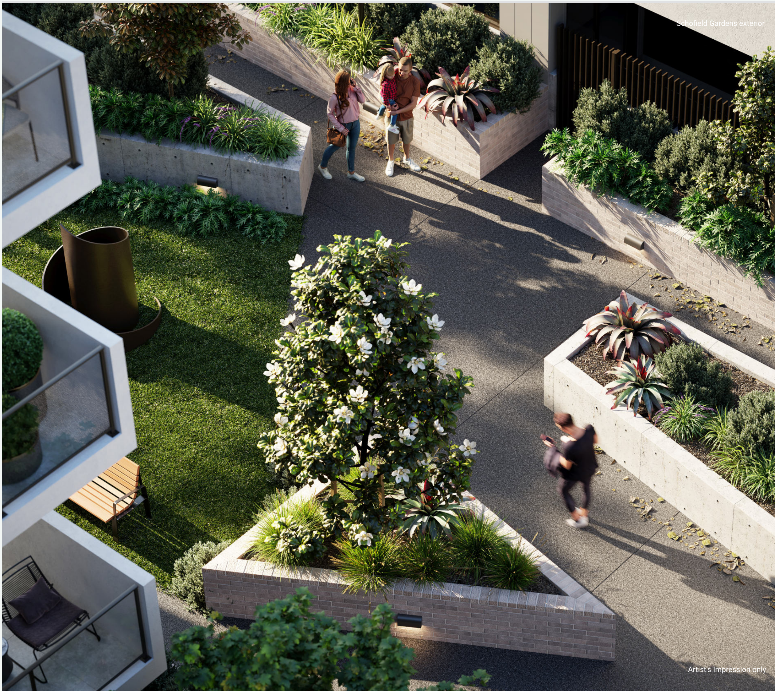
Schofield Gardens exterior