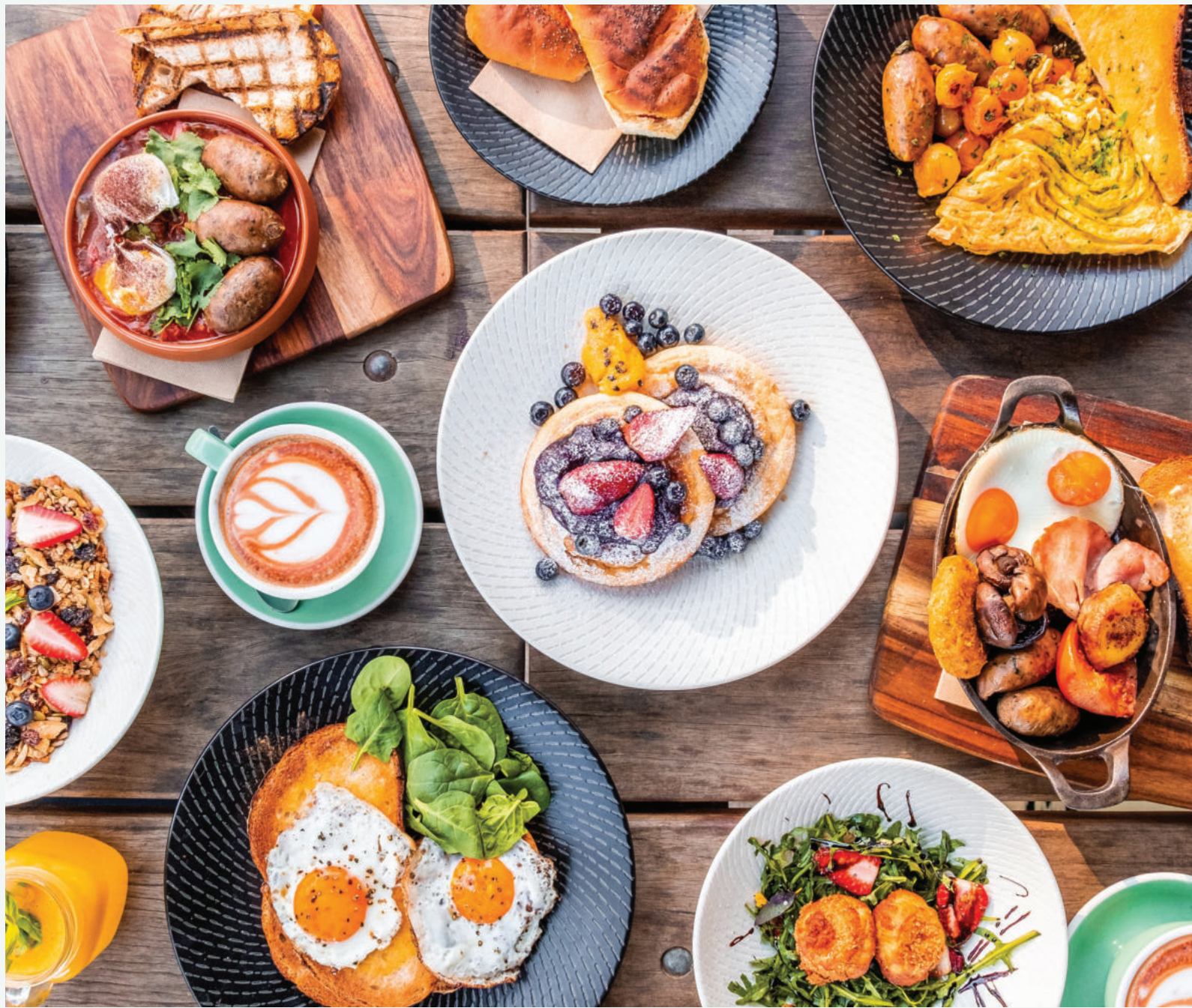
Limestone Cafe, Schofields