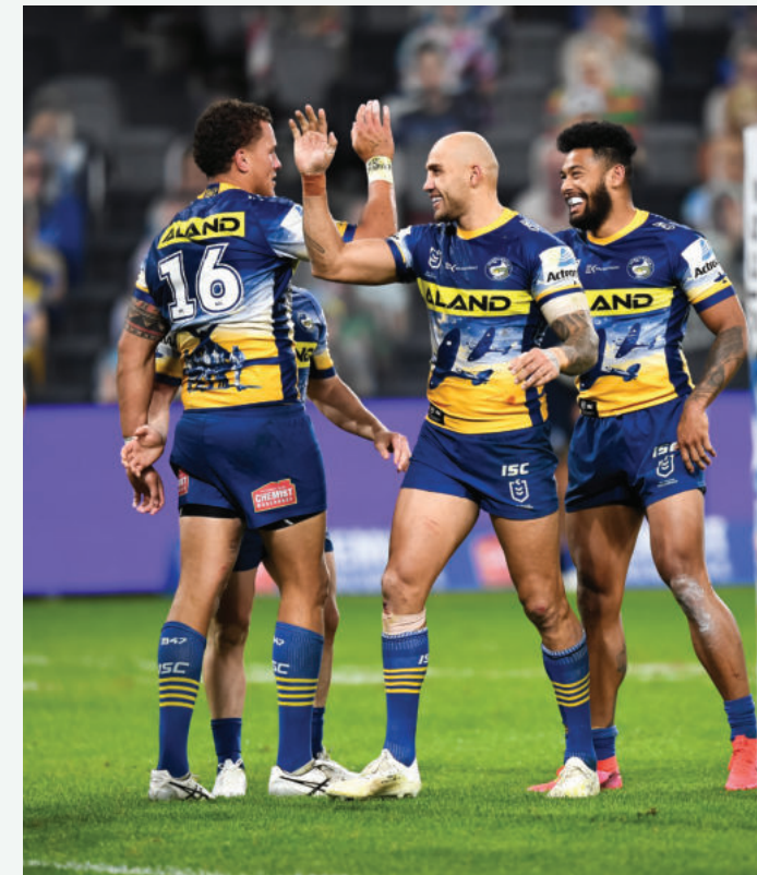
Proud major sponsors of the Parramatta Eels

ALAND's experienced internal team of architects, designers and project managers understand the needs of the local market. Working together, they conceived, planned and built this project to be the best that Schofield's has to offer. This collaborative approach allows the engagement of well-honed leadership skills, industry knowledge and meticulous attention to detail to achieve exceptional results and deliver high quality projects that are consistently best in market.